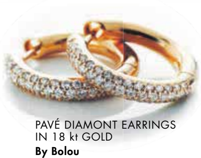
PAVÉ DIAMONT EARRINGS IN 18 kt GOLD By Bolou